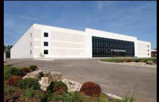
3365 Mainway, Burlington

A critical assessment of any property varies according to the needs of the specific investor. Individual and corporate tax categories, available capital, leverage considerations, future value analysis, highest and best use determination, all influence the investment and property management approach. These are discussed in detail by Gottardo Property Management Services with investor or owner clients.