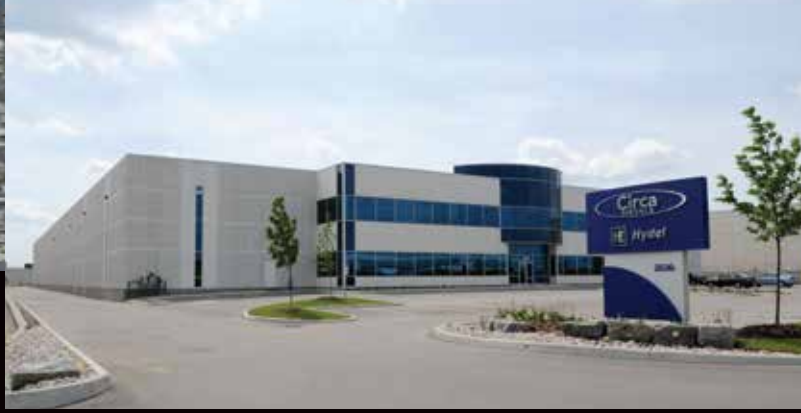
206 Great Gulf Drive, Vaughan