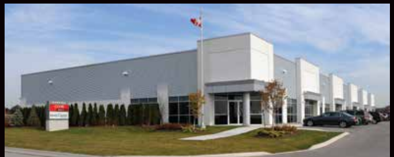
Beacon Hill Business Park, Stouffville