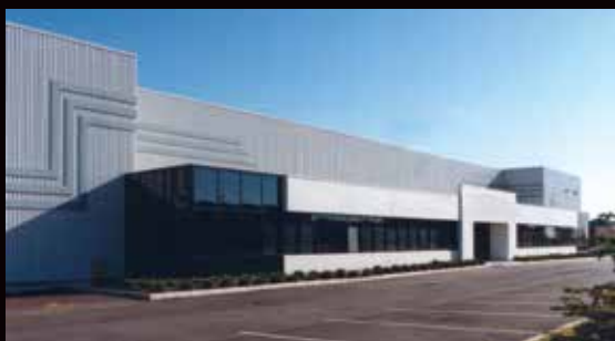
190 Annagem, Mississauga