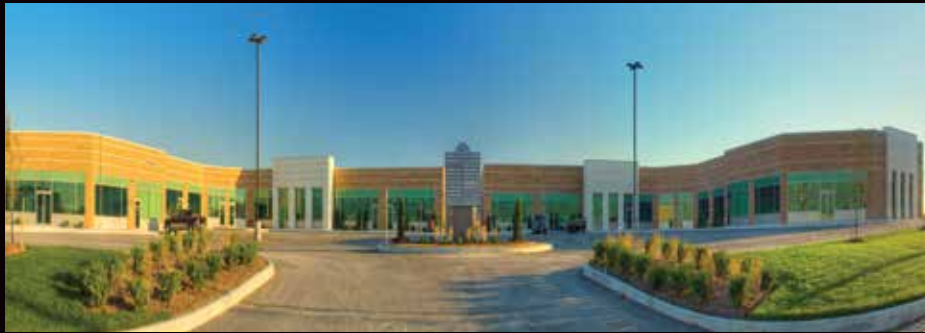
King Crossing Business Park, Barrie