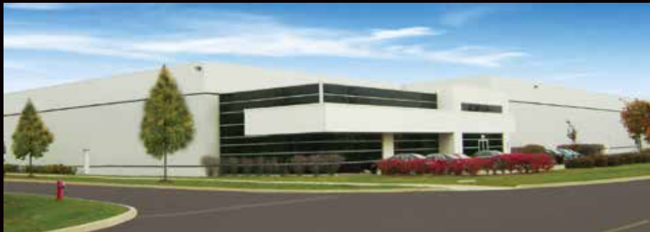
2351 Winston Park Drive, Oakville