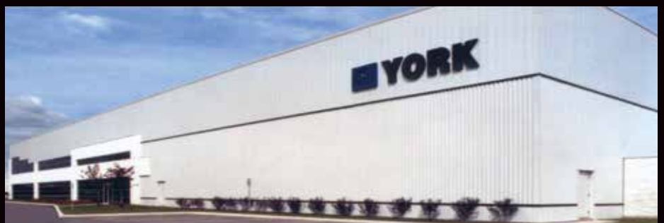
2323 Winston Park Drive, Oakville