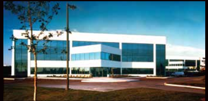
Acadia Office Complex, Markham

Our financial and administration services cover the complete scope of commercial and industrial management needs. Fully computerized with the most up-to-date financial and real estate management software available, we professionally design a financial package to suit each of our client's requirements, resulting in superior service, trust and satisfaction.