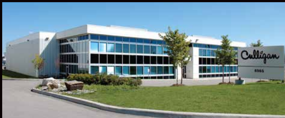
8985 Airport Road, Brampton

A responsible, mature custodian, specifically trained in modern maintenance methods and energy equipment is appointed resident manager, when applicable. High priority is placed on maintaining a responsive team, quality "housekeeping" standards, municipal regulations, good tenant relations, and rent collection. Our maintenance staff visit sites on a regular basis identifying and resolving issues to ensure a clean and safe working environment for all our occupants and visitors. We ensure quality communications exist between Gottardo Property Management Services and your facility's tenants. We offer our clients peace-of-mind and reassurance with our reliable 24-hour emergency maintenance hotline.