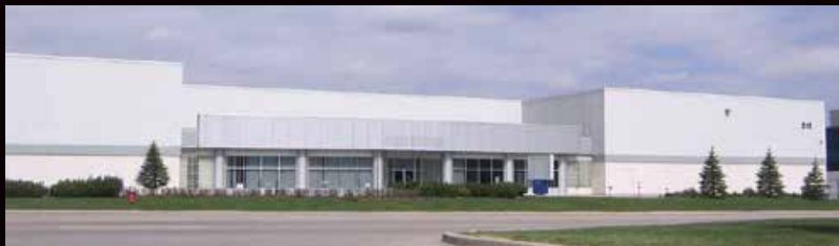
215 Courtney Park, Mississauga

Many facilities can often be enhanced on a nominal budget. Interior and exterior design, creative space planning including special partitions and appropriate lighting all work together to make a property more desirable. Gottardo Property Management Services will coordinate the construction, leasing and management of your property which may include tenant leasehold improvements with our in-house construction services. Our buying power ensures preferred pricing and exceptional service. Our tendering expertise ensures competitive pricing to our client offering the highest quality of services and materials.