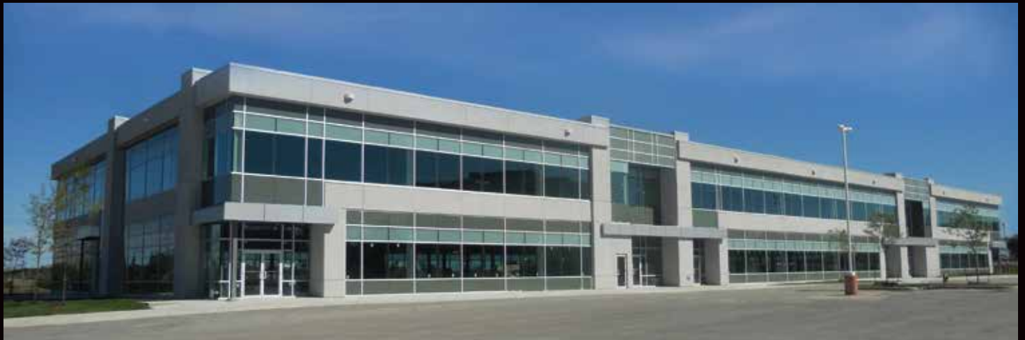
Galaxy Airport Centre, Toronto