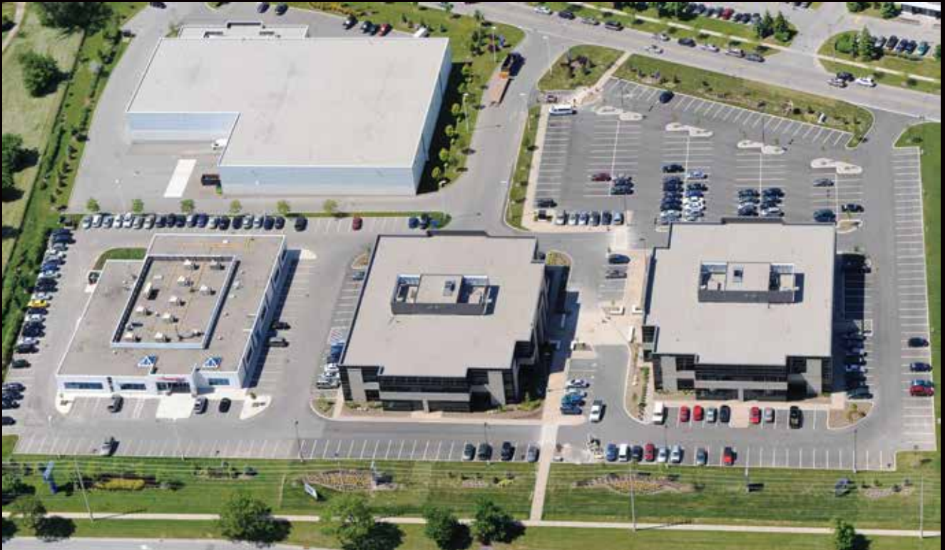
TEQ Corporate Centre, Oakville

As an investor, what better way to enjoy the carefree ownership experience...how much is your peace-of-mind worth?