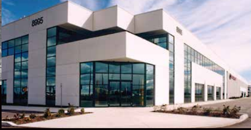
8995 Airport Road, Brampton