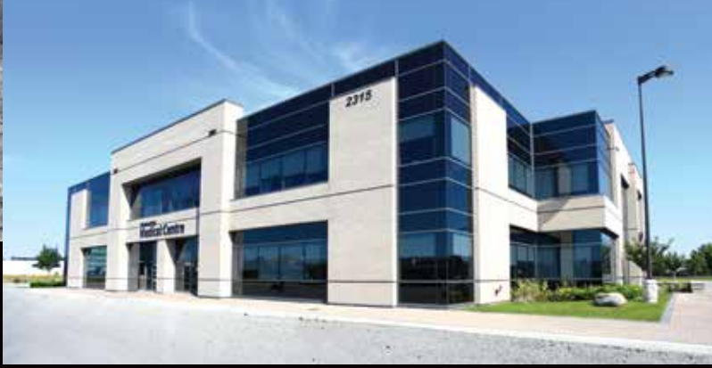
2315 Bristol Circle, Oakville